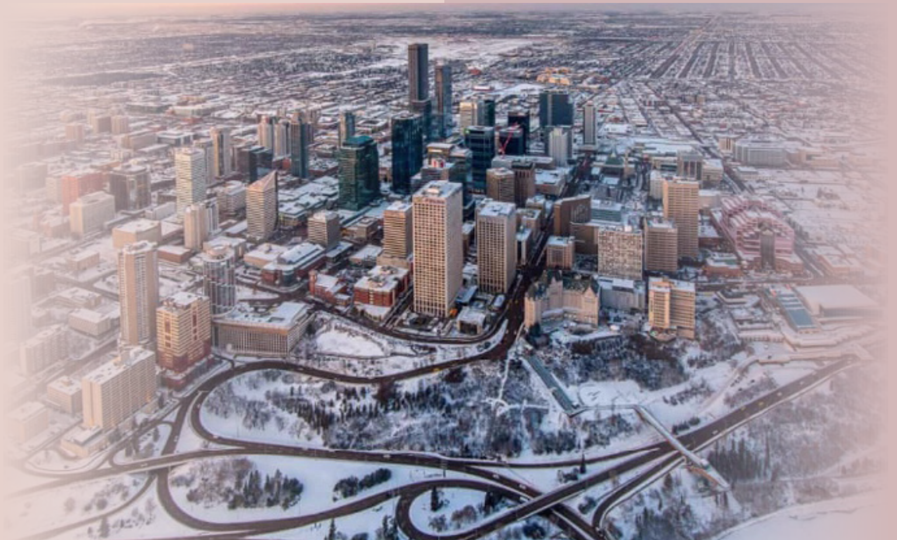
EXHIBIT HALL BALLROOM – BRITISH COLUMBIA/ALBERTA/YUKON

PLENARY BALLROOM – SASKATCHEWAN & MANITOBA